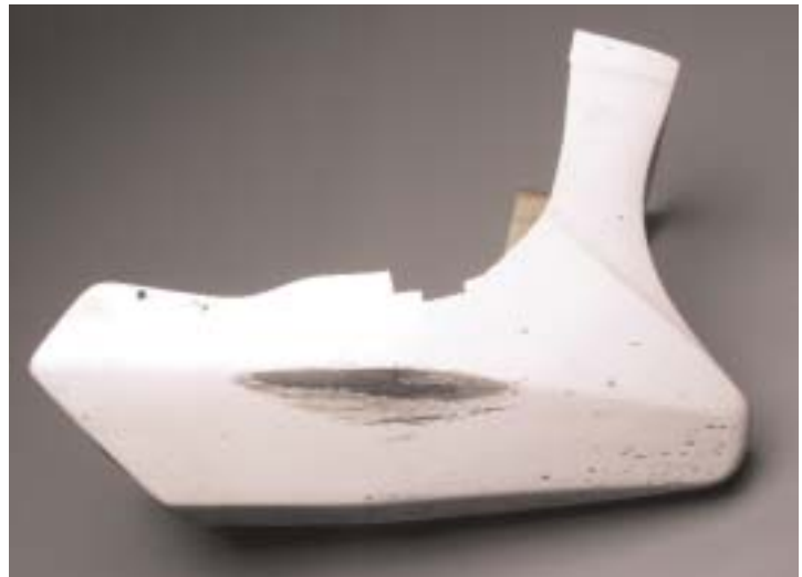
Although dragging bodywork is relatively benign, beware: Hard parts usually aren't far away. To increase the ride height without altering the chassis attitude, the front and rear of this bike needed to be raised an equal amount to eke out some more clearance on a tight and bumpy track.

After each change—either front or rear—reassemble your bike and ride it to make sure you haven't created handling problems. If you have, set your suspension back to the previous state before the problem cropped up. If you have lowered the bike, remember that you have decreased your cornering clearance. If you were touching down toe feelers before, carefully build up to maximum lean so you can find where it is. If you drag hard parts, you can lever (or high-center) one of your wheels off the ground, putting you and your bike in a world of hurt.